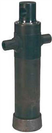
ATTACCO A SFERA BALL-FITTING